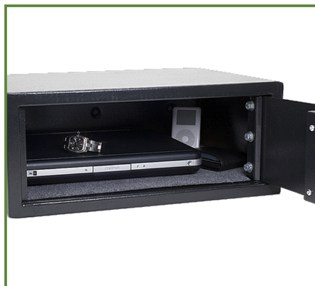
HOLDS 17" LAPTOP & MORE