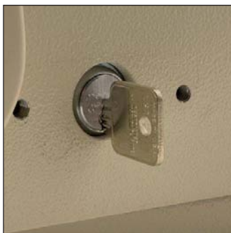
Optional Medeco™ Fail-Safe Key Lock Override