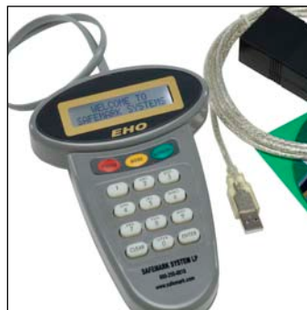
Emergency Handheld Override (EHO)